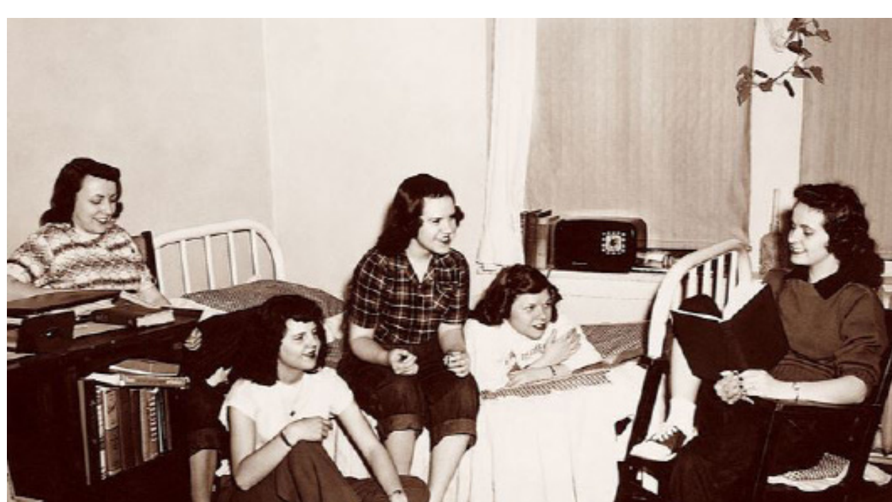
This 1949 photo shows students in a Residence Hall (Now Roberta Hall). When fire damaged the hall in 1951, this photo was released to local newspapers as an example of a typical dorm room.